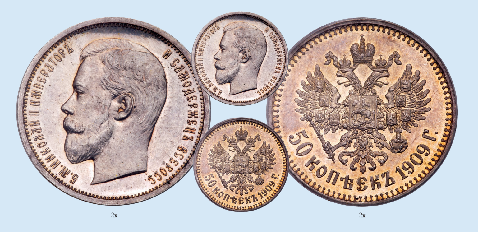
2227 50 Kopecks 1909 ЭБ. Bit 88 (R1), Sev 4140 (S). Authenticated and graded by PCGS PR 63 (Pre-2008 holder, # 1011542). A most handsome example. Very choice brilliant PROOF.