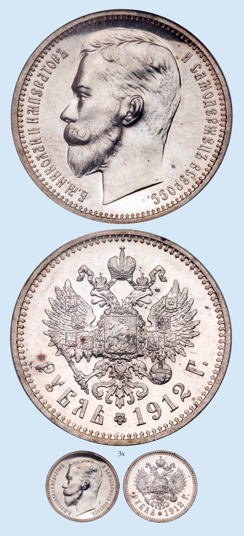
Choice Proof 1912 Rouble - Ex Irving Goodman Collection

2226 Rouble 1912 ЭБ. Legend longer under neck. Bit 66, Sev 4163. Authenticated and graded by PCGS PR 62 (Pre-2008 holder, # 925913). Small reverse toning spot. Snow white, blazing lustre in mirrorlike fields. Choice brilliant PROOF.